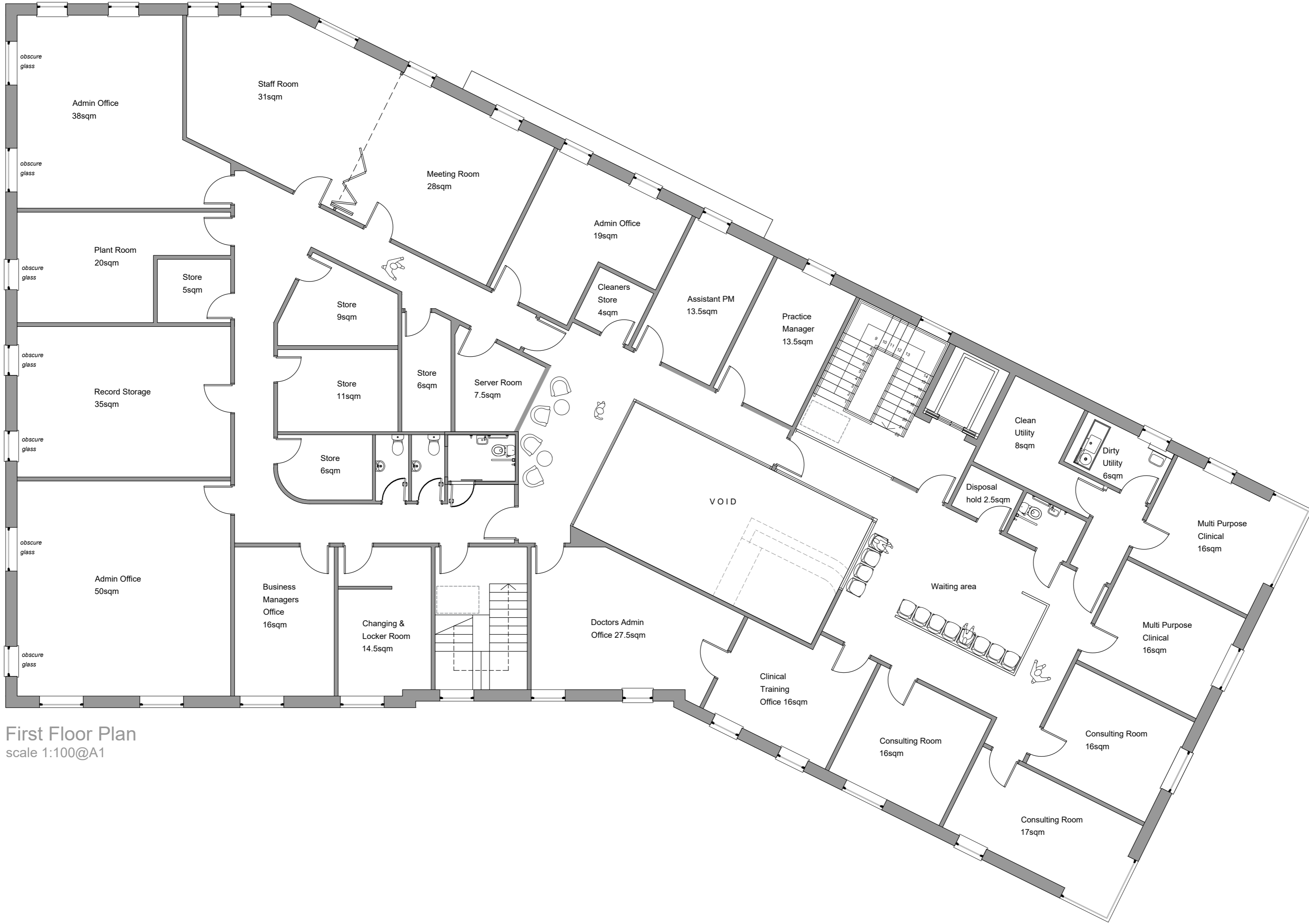
First Floor Plan scale 1:100@A1